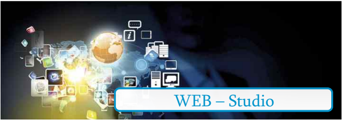
WEB - Studio